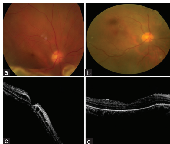
Figure 1: (a) Detached retina at presentation (b) retina well settled postscleral buckling surgery at 2 weeks (c) optical coherence tomography at presentation (d) optical coherence tomography postscleral buckling at 2 weeks

RD could be treated either by carrying out scleral buckling or doing pars plana vitrectomy and silicon oil/gas tamponade. Management of RRD, in pregnancy needs special consideration as both patients were one-eyed and any delay in surgery would alter the visual prognosis, and at the same time managing such patients without causing any harm to their pregnancy and fetus. The questions on our mind were (1) type of anesthesia (2) posture during surgery (3) posture following surgery (4) safety of medications in pregnancy (5) to provide them vision as early as possible.