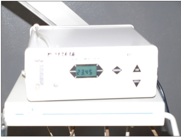
Figure 1: Halimeter

Immediately after instituting the treatment applicable [Figure 2], most of the subjects (364/400) had a concentration of VSC