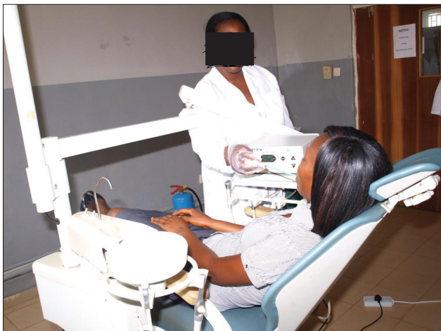
Figure 3: Halimeter in use

less than 181 ppb. Nineteen subjects with periodontal disease had concentration of VSC between 181 and 250 ppb, and 17 subjects with periodontal disease had concentration of VSC greater than 250 ppb ( P = 0.01 ) [Table 3]. The mean concentration of VSC concentration was reduced to 46.6 (3.2) ppb and 106.2 (9.5) ppb in the group with no periodontal disease and the group with periodontal disease, respectively [Table 1].