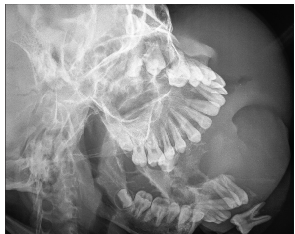
Figure 4: Oblique lateral radiographic view of the 7-year-old boy [Figure 2a] showing gross destruction of the mandible