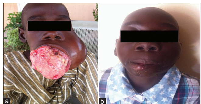
Figure 2: (a) Preoperative photograph of a 7-year-old boy with odontogenic fibromyxoma involving the mandible. Note the tumor has filled the whole mouth thus impeding adequate feeding. (b) Postoperative view of the same patient 2 years postsurgery