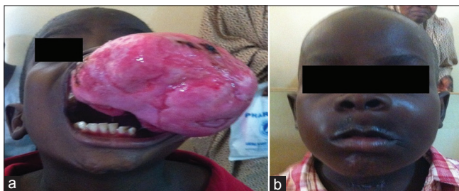
Figure 1: (a) Preoperative photograph of an 8-year-old boy with odontogenic fibromyxoma involving the maxilla. Note the gross disfiguring nature of the tumor. (b) Postoperative photograph of the same patient 2 years postsurgery

Consistent histologic finding in our patients was that of an unencapsulated lesion with the proliferation of fusiform and stellate-pattern or spindle-shaped cellular components dispersed in abundant myxomatous stroma with a few collagen fibers. These undifferentiated mesenchymal cells were noted by Adekeye et al. [15] to exhibit abundant extracellular production of ground substance and thin fibrils which are capable of fibroblastic differentiation. The lesion is thus classified as OFM or odontogenic myxofibroma depending on differentiation pattern, whether predominantly myxoid or fibrous, respectively.