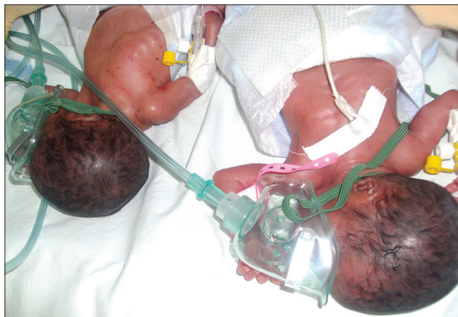
Figure 1: Diamniotic–dichorionic twins; first day post delivery admitted at Bugando neonatal unit

Fourteen days after discharge, the patient was readmitted with peritonitis which necessitated repeat laparotomy and attempt to remove the placentas provoked massive hemorrhage which was controlled by intra-abdominal packing and the patient was transfused with 3 units of blood. The abdominal packs were removed after 48 hours with no active bleeding from placental site. Eight days after removing the packing, the patient developed fascial dehiscence and was taken to operating room for exploration, where both placentas were easily detached without provoking bleeding. Her postoperative recovery thereafter was unremarkable, and she was discharged to attend outpatient clinic. After three visits of 11 months, she was discharged from the clinic in a good condition.