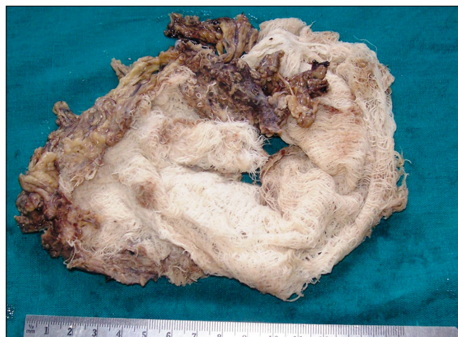
Figure 1: Photograph showing the specimen of gossypiboma - gauze adherent to omentum

A study reported that emergency surgery, unplanned change in the operation, and body mass index were statistically significant risk factors for retained foreign bodies. Surgeons should place radiologically detectable sponges and towels in