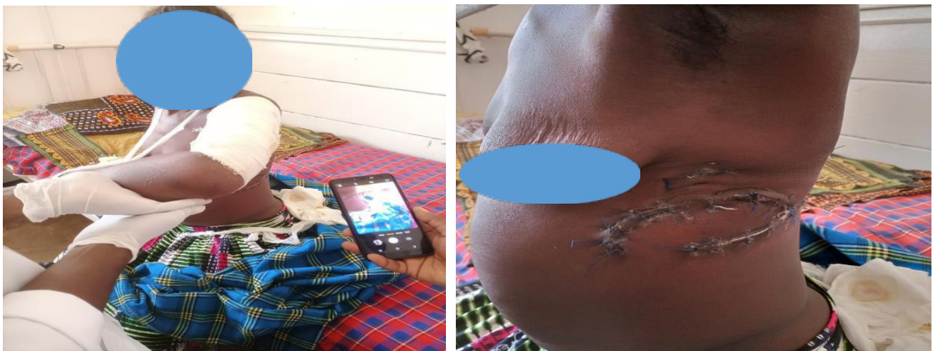
Figure 2: Post-operative