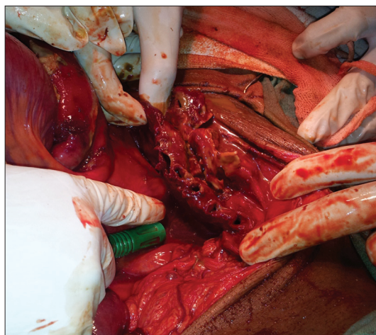
Figure 1: Intra-operative on table view of multiple perforations

In our case report, patient was a middle aged Indian male; enteric perforation is more common in middle aged male because they are more exposed to infection as they consume food outside, which may be unhygienic. [10] Traditionally, diagnosis is made mainly on the basis of clinical history and examination, X-ray abdomen, and ultrasound abdomen supported our diagnosis.